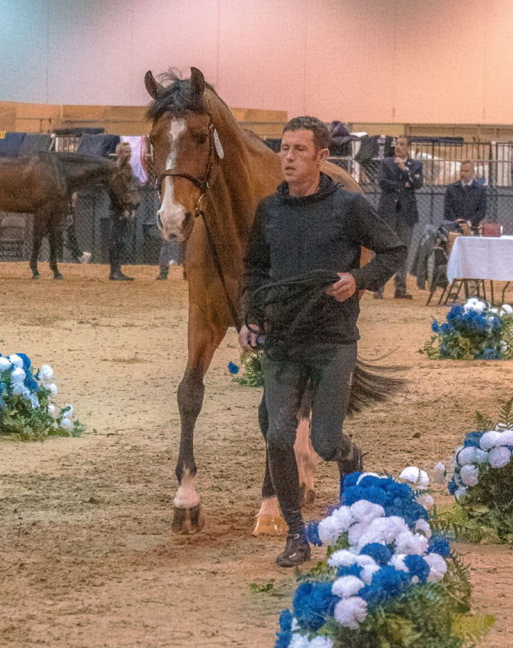
Scott Brash (GBR) and Hello Jefferson